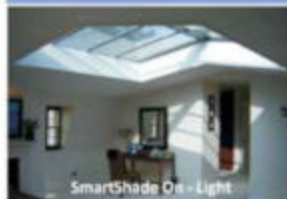
SmartShade On - Light