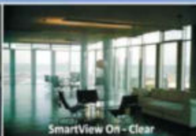
SmartView On - Clear