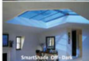
SmartShade Off - Dark