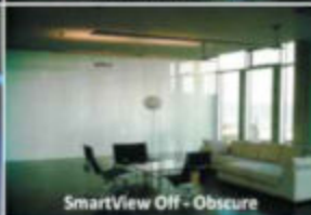
SmartView Off - Obscure

We are a world leader in the design, manufacture and installation of switchable glass solutions for international architectural, commercial and residential projects.